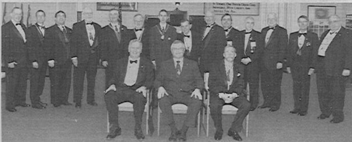
New Legionnaires with members of the Investiture Team.