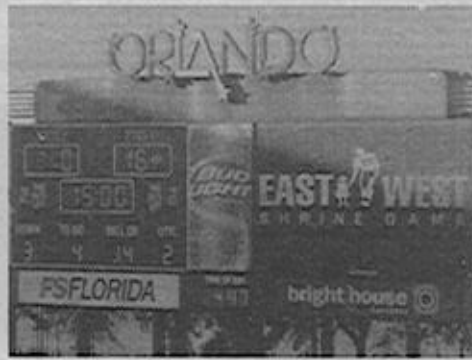
Final Score ... East - 25; West - 8

As luck would have it, the Shrine East-West Game was being played while